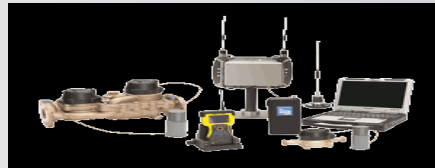
Click the photo to learn about the Badger Meter Orion AMA System