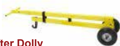
8100403 Manhole Lifter Dolly