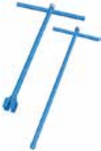
Lighted Curb Key