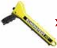
XTPC+ Pipe and Cable Locator Kit