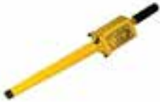
GA-72Cd Magnetic Locator