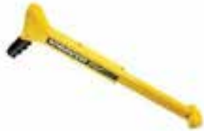
GA-92XTD Magnetic Locator